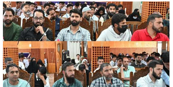
THE KASHMIR TALK BUREAU SHOPIAN:

As part of the nationwide Dharti Aaba Janbhagidari Abhiyan under the Ministry of Tribal Affairs, district administration Shopian initiated the team formation process for the upcoming awareness and benefit saturation camps scheduled from June 15 to June 30, 2025.