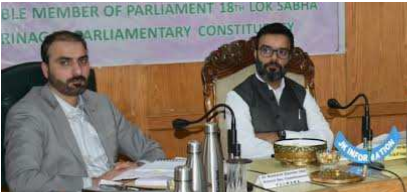
THE KASHMIR TALK BUREAU PULWAMA:

Reviews progress of CSSs; emphasizes saturation across all schemes with focus on purpose & outcome