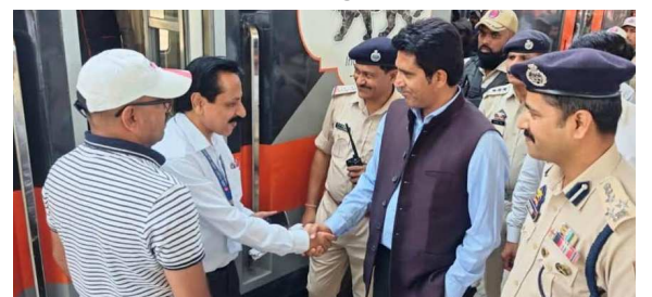
THE KASHMIR TALK BUREAU RAMBAN:

The inaugural Vande Bharat train to Kashmir was today warmly received at Sangaldan Railway Station—one of the key stop point on the prestigious Udhampur-Srinagar-Baramulla Rail Link (USBRL).