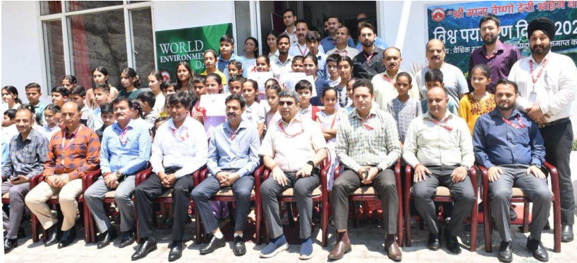
THE KASHMIR TALK BUREAU KATRA:

To commemorate World Environment Day, Shri Mata Vaishno Devi Shrine Board (SMVDSB) organized a special drawing and sketching competition at its high-tech nursery in village Kunya, Panthal, near Katra. The event, which saw enthusiastic participation from a large number of students of various age groups, focused on the