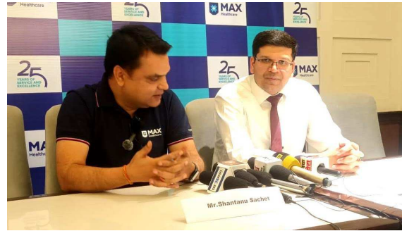
THE KASHMIR TALK BUREAU BARNALA:

"The field of surgical robotics is evolving at a rapid pace, revolutionising the way surgeries are performed and setting new standards for precision, efficiency, and patient outcomes,"