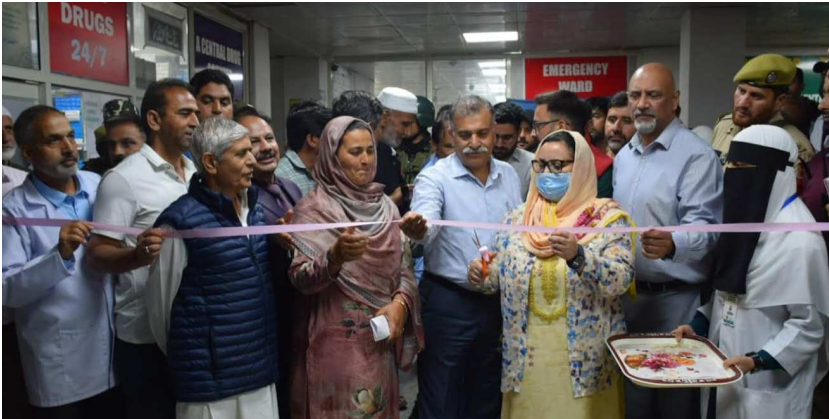
THE KASHMIR TALK BUREAU BANDIPORA:

Inaugurates Jan Aushadhi Kendra, Cancer Ward at hospital