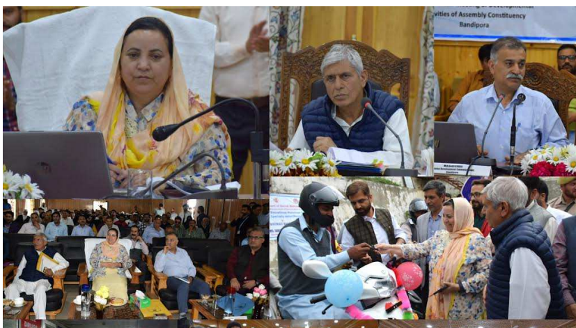
THE KASHMIR TALK BUREAU BANDIPORA:

Visits GDC Bandipora, takes stock of academic activities | Also hands over motorized tricycles, sponsorship amount of Rs. 1.23 crores among beneficiaries