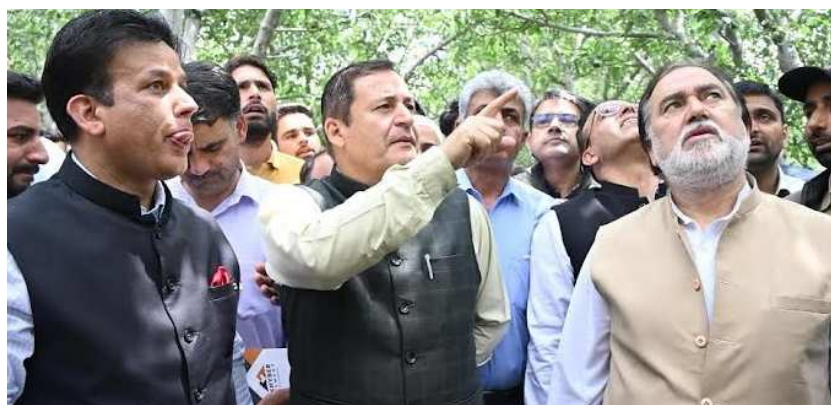
THE KASHMIR TALK BUREAU SRINAGAR: