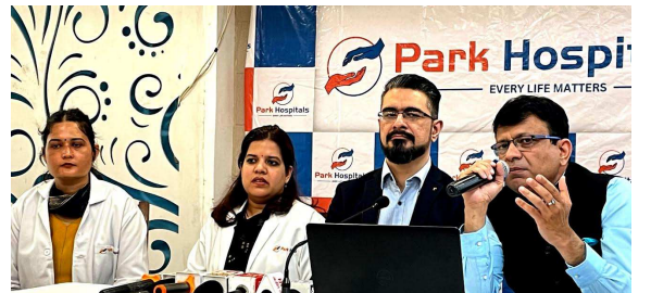
THE KASHMIR TALK BUREAU CHANDIGARH: